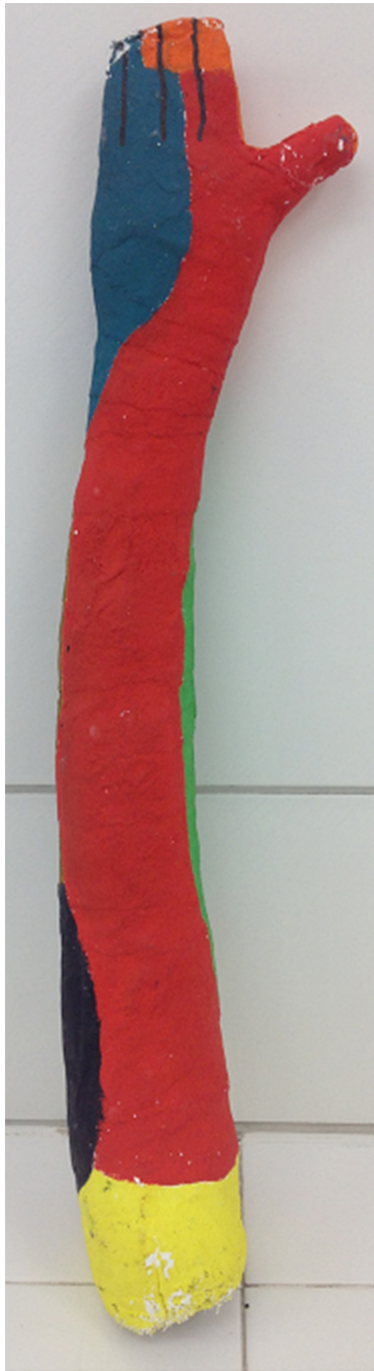
Figure 4. Upper limb dermatome.

According to the studies reported above, one can see the importance in the manufacture of neuroanatomic models, as an alternative form in the absence of corpse parts, enabling students to an understanding of the content to be worked in the practical classes, which could be observed with the applicability materials manufactured in this paper when presented to the students in practical classes and visits schools and colleges of the Petrolina city area.