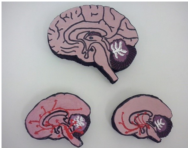
Figure 3. Reticular formation.

Dermatomes represent the cutaneous innervation of the human body (Gray and Goss, 2012). They were made the upper and lower limbs dermatomes. The models were made with plaster bandages then was used acrilix and oil inks, of different colors to highlight and to differentiate the regions innervated by the Peripheral Nervous System (PNS). These regions make up the areas of action of the brachial and lumbosacral plexi. The plexi, according Machado (2014), are sets of nerves originating SC and that supply members, which originate the cervical and lumbar intumescences to form the plexi mentioned above, respectively.