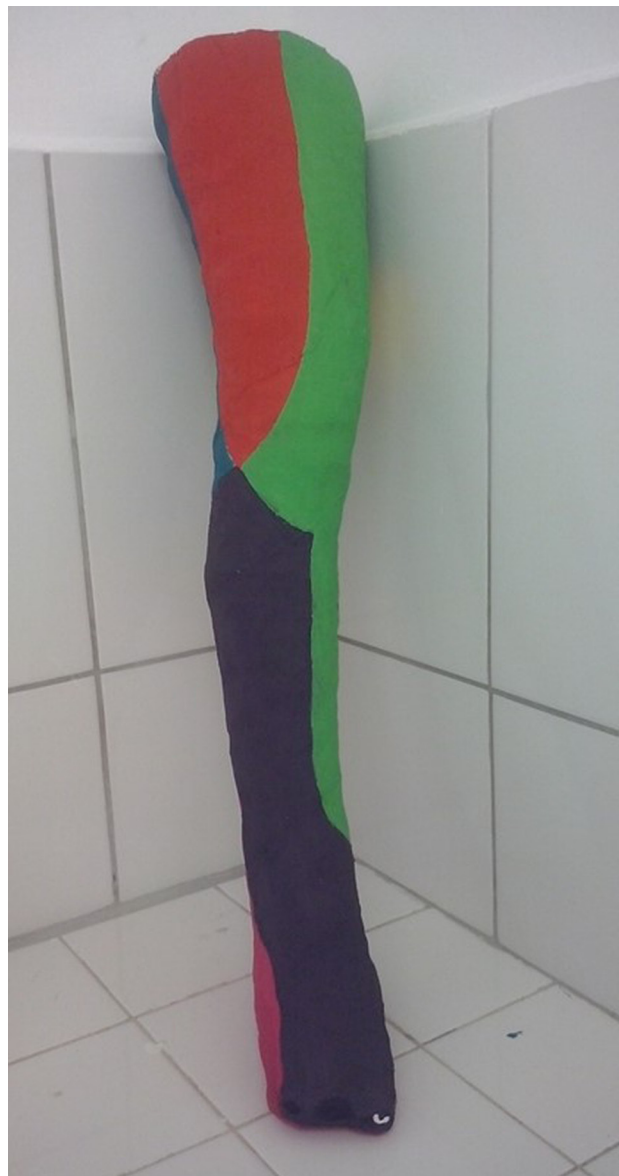
Figure 5. Lower limb dermatome.