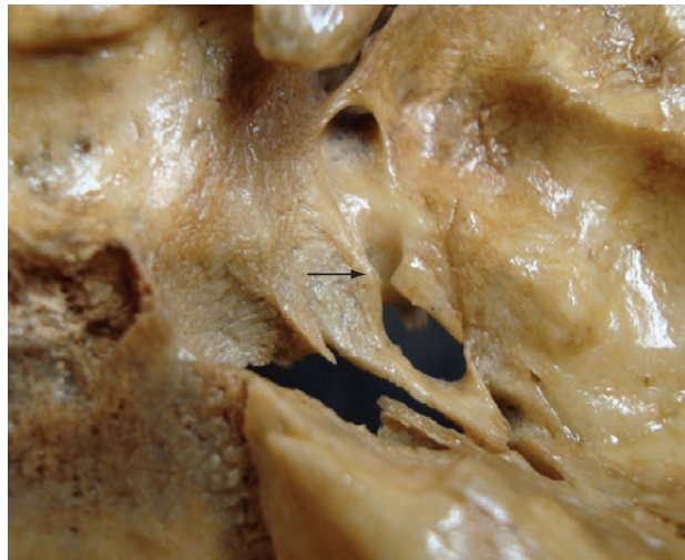
Figure 3. Internal view of skull showing the foramen of Vesalius partially fused with foramen ovale (indicated by the arrow).

In this study, the foramen of Vesalius was found at a distance to the foramen ovale from anterior to medial was 1.853 \pm 0.303 mm on the right and 2.464 \pm 0.311 mm on the left. The average distance between the foramen of Vesalius and the foramen ovale in the study of Shinohara, Melo, Silveira et al., (2010) was 2.55 mm on the right and 2.59 mm on the left side, close to the results of our study. Kaplan, Erol, Ozveren, et al. (2007) reported the foramen of Vesalius with a distance of 4 mm (range 3-5 mm) anterior and medial to the foramen ovale. According to Ramalho, Sousa-Rodrigues, Rodas et al. (2007), this measure is less than our results, they found 7 mm on the right and 6 mm on the left. In this study also was found a remarkable fusion of the foramen of Vesalius to the foramen ovale (Figure 3).