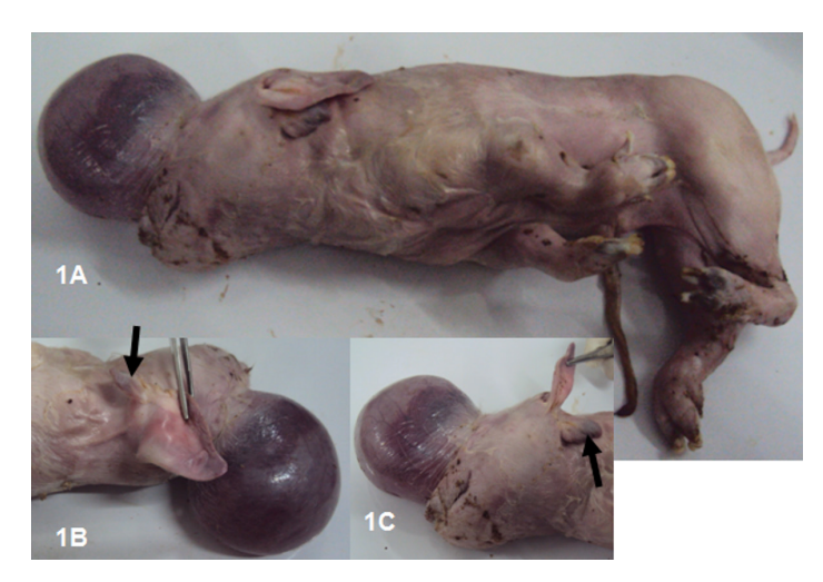
Figure 1. Piglet with meningoencephalocele. Note the twisted and deviated appearance of the two forelimbs and the asymmetry observed in the hindlimbs (1A), the duplication of the left and right pinnae (arrows in 1B and 1C respectively). Note also the absence of palpebral fissure on both sides (1A, 1B and 1C).