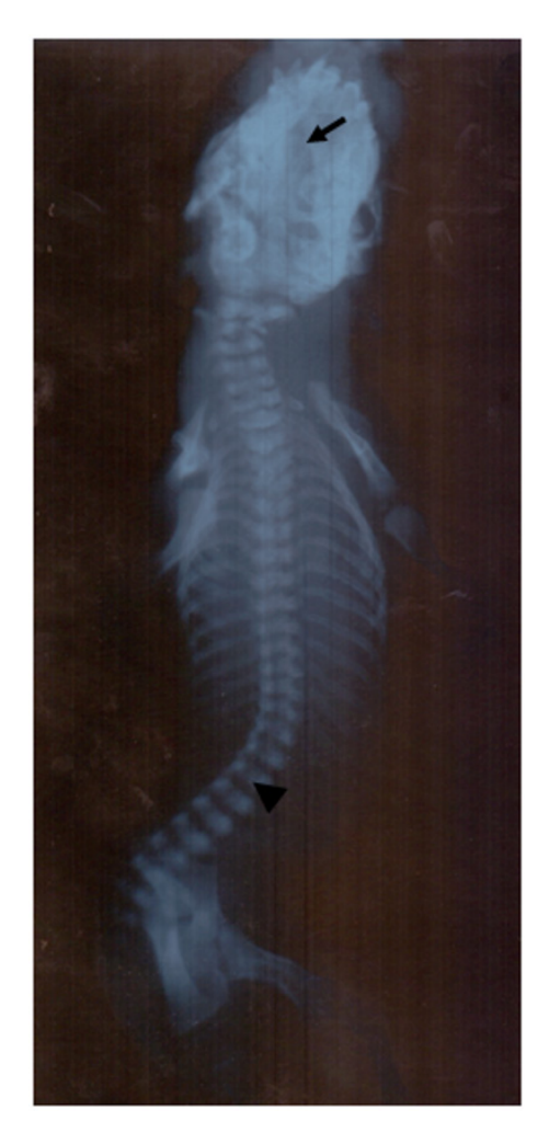
Figure 3. X-ray of the dorso-ventral view. Note the curvature of the vertebral column (arrow head) and the cranium bifidum (black arrow).

or extreme ambient temperature during the gestation period, and the pen of the dam was well aerated.