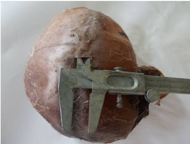
Figure 3. Showing measurement of width of superior sagittal sinus using vernier calliper.

in the human cadavers. Also, there is no data available for morphometric features of dural venous sinuses.