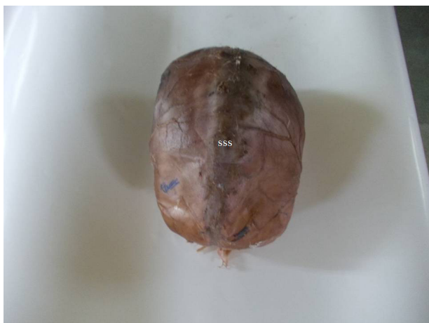
Figure 1. Superior view of the dura mater (meningeal layer) showing superior sagittal sinus (SSS).

Each sigmoid sinus curves inferomedially and turns forward to the superior jugular bulb (STANDRING, GRAY, ELLIS et al., 2008).