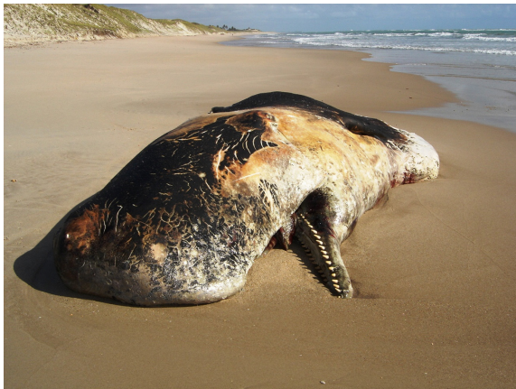
Figure 1. Studied female sperm whale, Physeter macrocephalus , stranded in Campina's Beach (06° 46' S, 34° 55' W), Paraíba state, northeastern Brazil.