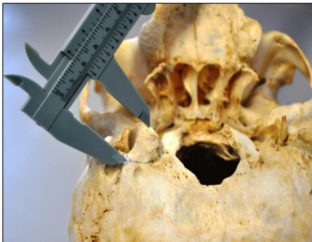
Figure 3. Measurement with a pachymeter of the height of the paramastoid apophysis on the right side.

unilateral (right side), articular with the transverse processes of the atlas and 18.10 mm of elevation.