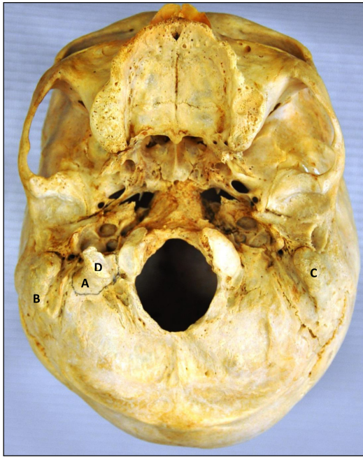
Figure 1. Inferior view of the skull. A - right paramastoid apophysis B-right mastoid process, C - left mastoid process, and D - Facet joint with transverse process of the atlas.