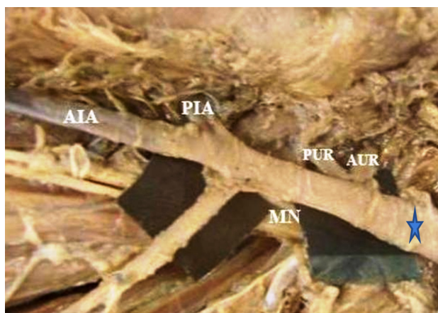
Figure 2. Photograph showing the branching pattern of the additional artery which was arising from the brachial artery (*-additional artery arising from the brachial artery; AUR-anterior ulnar recurrent artery; PUR-posterior ulnar recurrent artery; MN-median nerve; PIA-posterior interosseous artery; AIA-anterior interosseous artery).

interosseous membrane, pierces the interosseous membrane proximal to pronator quadratus and anastomoses with the posterior interosseous artery in the posterior compartment of the forearm (STANDRING, 2008). There are few cases reported in the literature about the superficial ulnar artery. The superficial ulnar artery is defined as an ulnar artery which branches from the axillary, brachial or superficial brachial arteries, courses over the forearm flexor muscles and coexists with a brachial or superficial brachial artery that branches into either the radial and common interosseous arteries or, less frequently, into the radial and ulnar arteries. Presence of a superficial ulnar artery seems to be a rare variation with the incidence of 0.7%-9.4% in the literature (BHAT, POTU and GOWDA, 2008). The superficial ulnar artery may replace the ulnar artery altogether or it may supplement it. In our case,