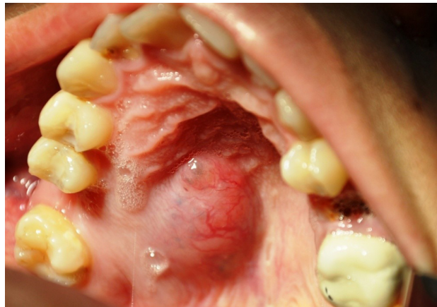
Figure 1. Occlusal view showing the swelling of the hard palate on the right side.

This tissue change entails formation of osteolytic lesions, deformities and fractures (ATALLA, HALLACK NETO,