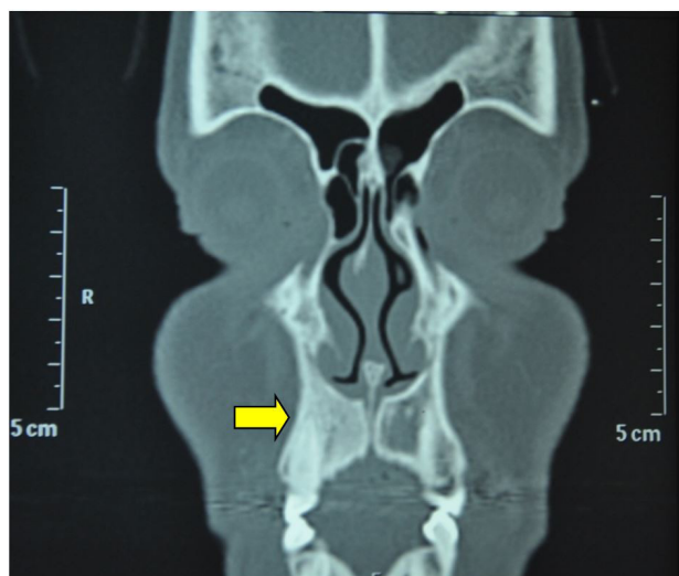
Figure 4. Coronal computed tomography indicating increased bone density in the right maxilla.

GOLLNER et al., 2010; SIMONATO, SANTOS, TAKANO et al., 2009). It is a benign condition characterized by replacement of bone by disorganized fibrous tissue and immature bone which, histologically, has numerous degrees of metaplasia (ADBELKARIM, GREEN, STARTZELL et al., 2008). This term was given pretending to indicate the condition represented a dysplastic growth resulting from disorganized mesenchymal cell activity, or a defect in the control of bone cell activity. A genetic defect involving Gs\alpha protein seems to support this process, affecting the proliferation and differentiation of fibroblasts / osteoblasts what comprises these lesions (REGEZI, SCIUBBA and JORDAN, 2012).